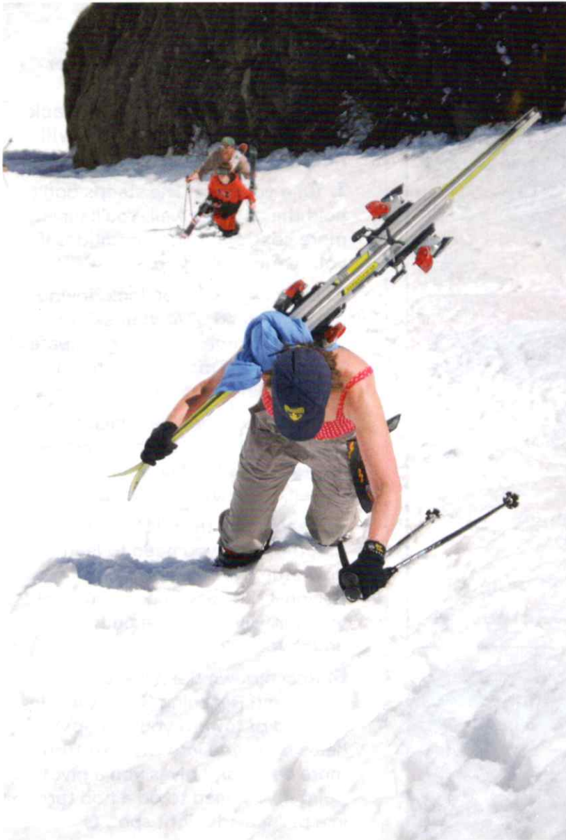
Left: Skiers ascending the headwall in Tuckerman Ravine on Mount Washington.