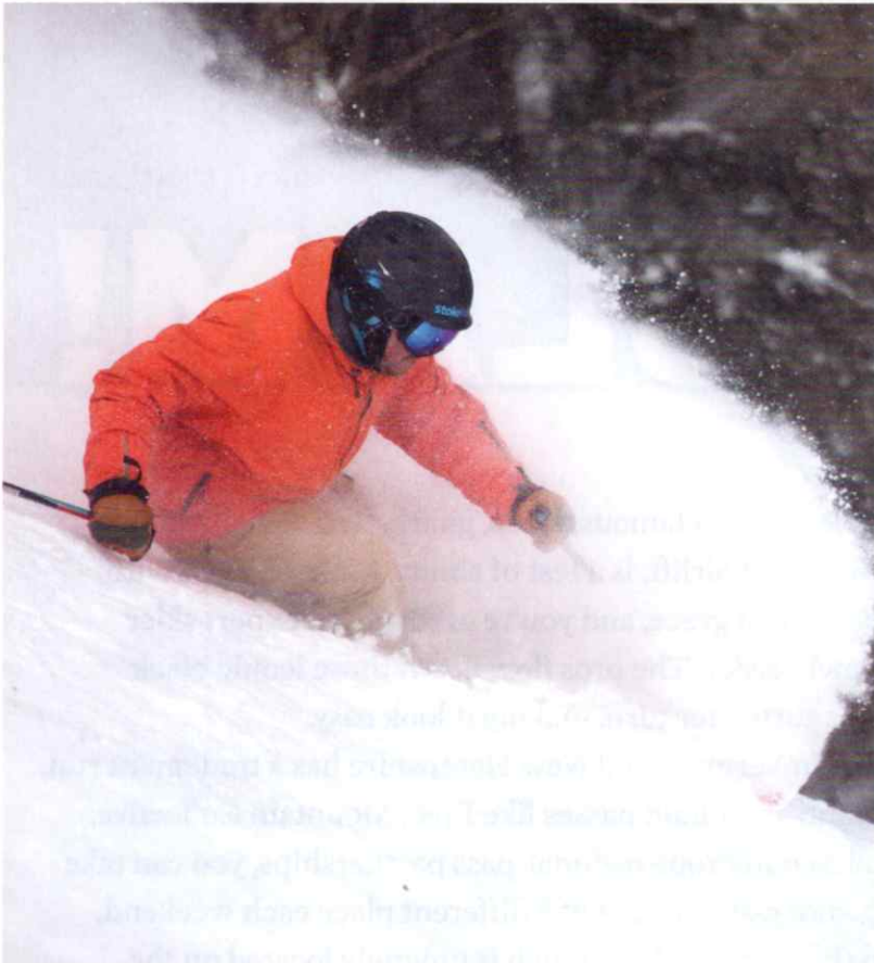
Left, top and bottom: A powder day can make the moguls more forgiving.