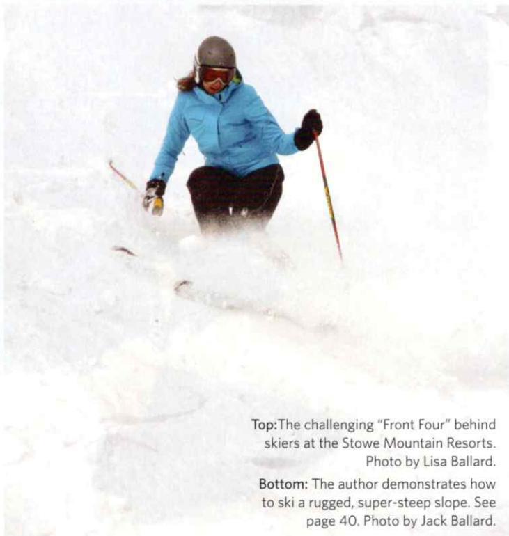
Top: The challenging “Front Four” behind skiers at the Stowe Mountain Resorts.