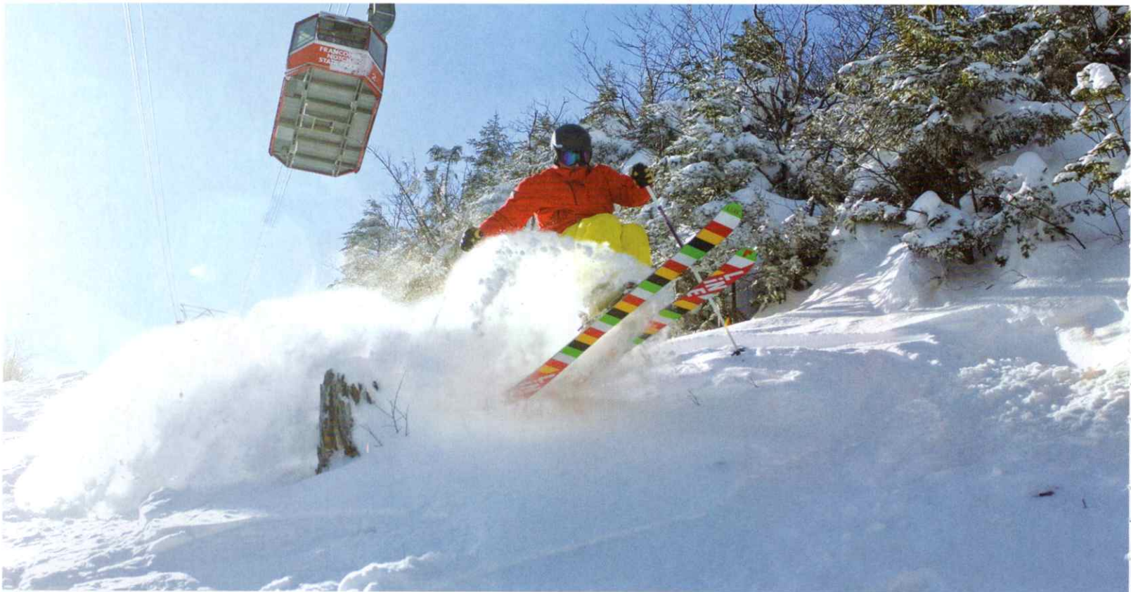
Top: A skier catches air on DJ's at Cannon Mountain.