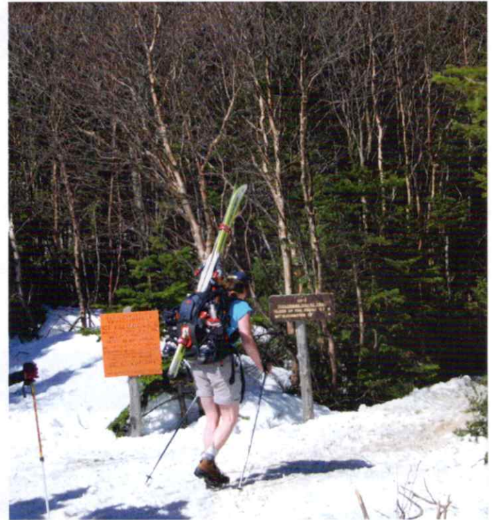
Right: A skier at the trailhead in Pinkham Notch, heading to Tuckerman Ravine.