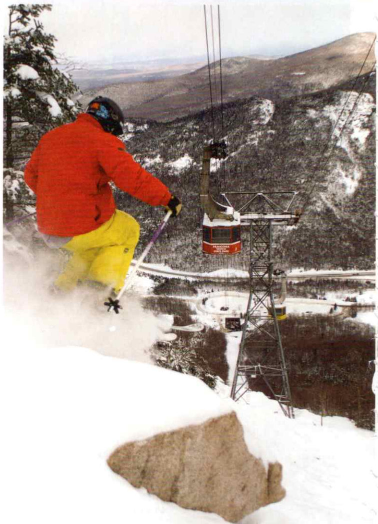
Right: Heading down DJ's as the Cannon tram approaches overhead.