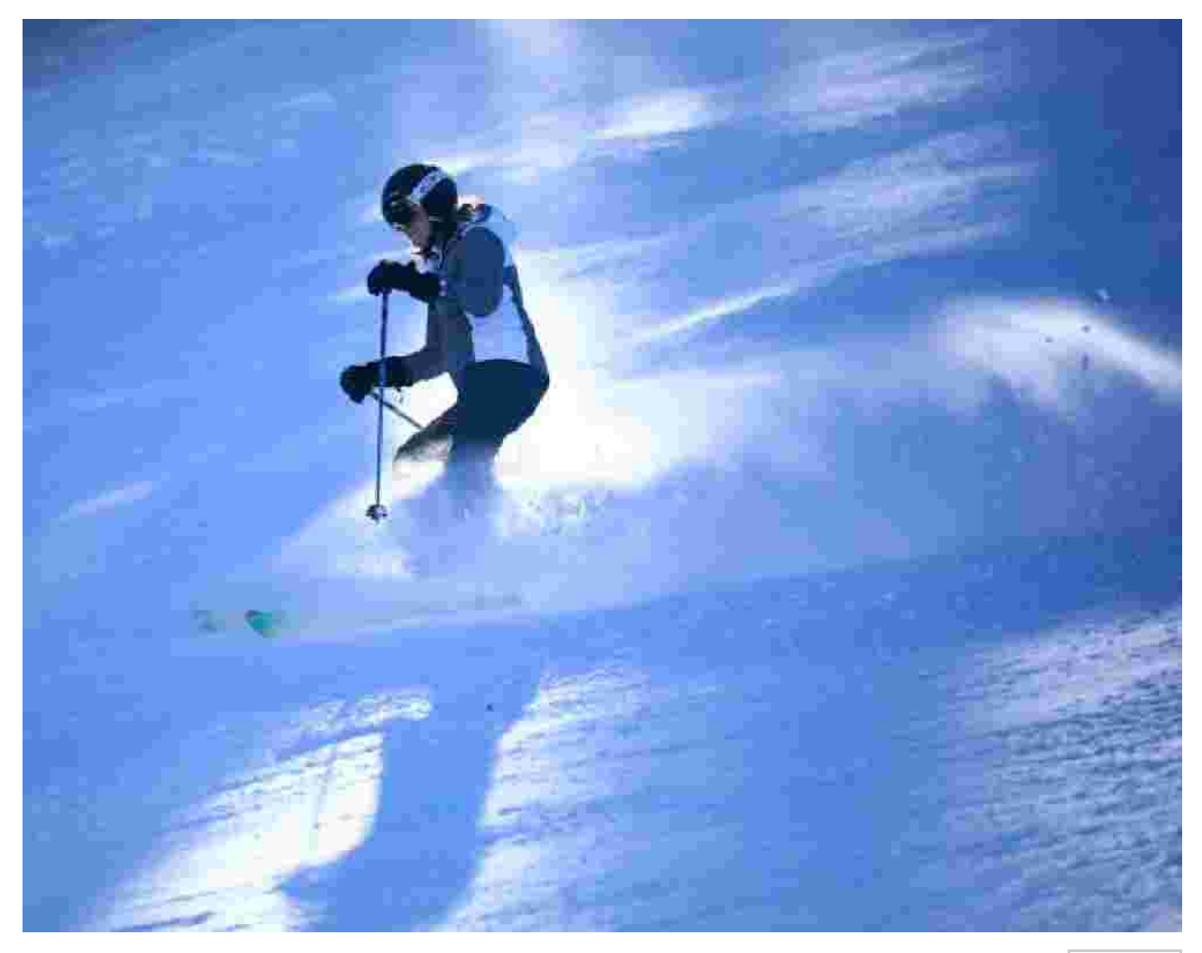
A skier makes her way through fluffy powder snow at Solitude.

Utah's Solitude offers variety in a small package | Outdoors ... Page 3 of 6