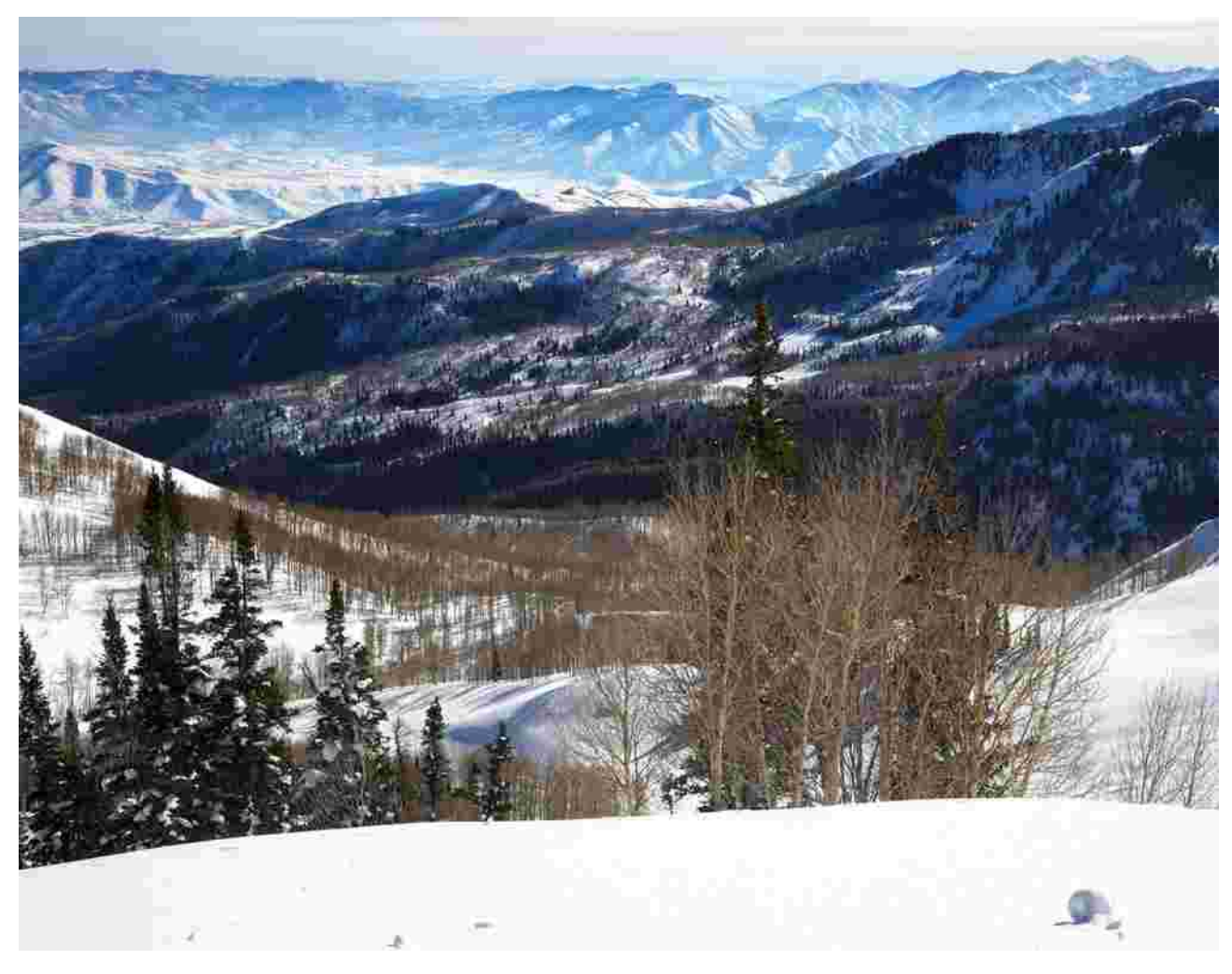
Views of the Wasatch Mountains of Utah, and more distant peaks, are part of the allure from runs at Brighton.