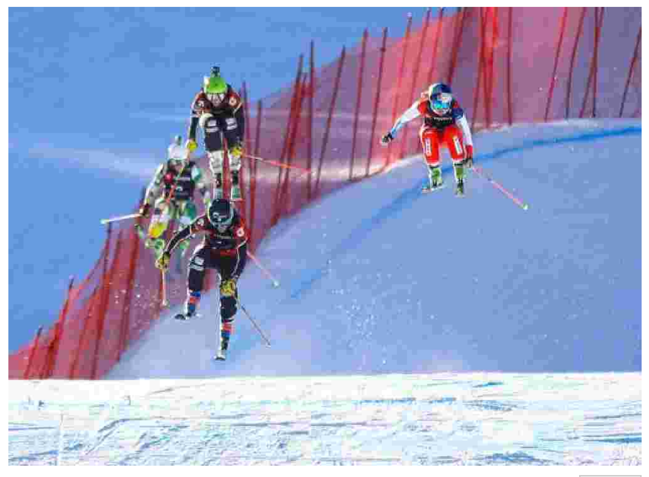
A quartet of skiers fly over the slopes during the 2019 Freestyle World Championships Skier/Bordercross qualifying round at Solitude.

Utah's Solitude offers variety in a small package | Outdoors ... Page 5 of 6