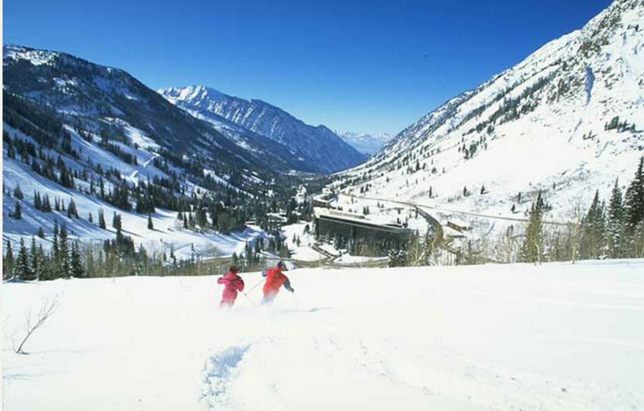
Snowbird Skiers, photo by Scott Markewitz.

View the agenda and see more photos . . .