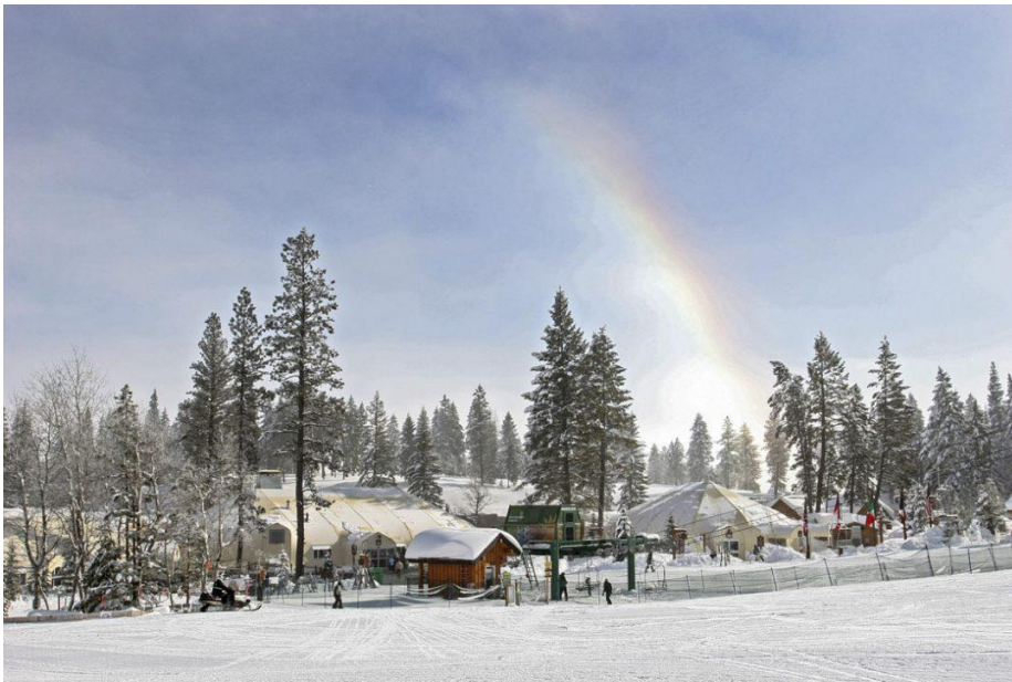
The base at Tamarack Resort with sports and cafe domes and a snow rainbow.

Almost Down And Out, This Resurrected Resort Returns As A Bargain For Senior Skiers.