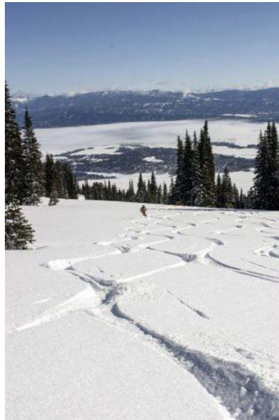
Skiing powder at Tamarack Resort.

Vertical: 2800 feet, top at 7,700 feet, base at 4,900 feet.