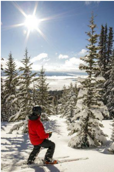
Skiing powder at Tamarack, Donnelly, ID., near McCall.