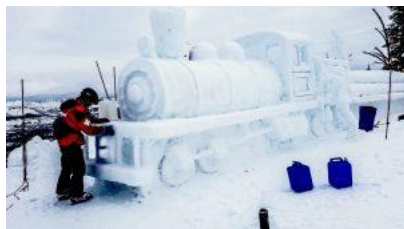
Ski patroller helps put finishing touches on snow train in preparation for Winter Carnival in McCall.

Location: In McCall, Idaho, 107 miles north of Boise in west central Idaho.