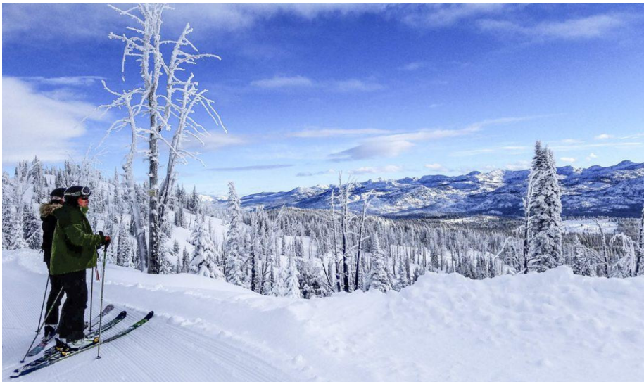
View from the top of Brundage Mountain.

Tags: Brundage Mountain , seniors skiing , SeniorsSkiing Guide , SeniorsSkiing.com