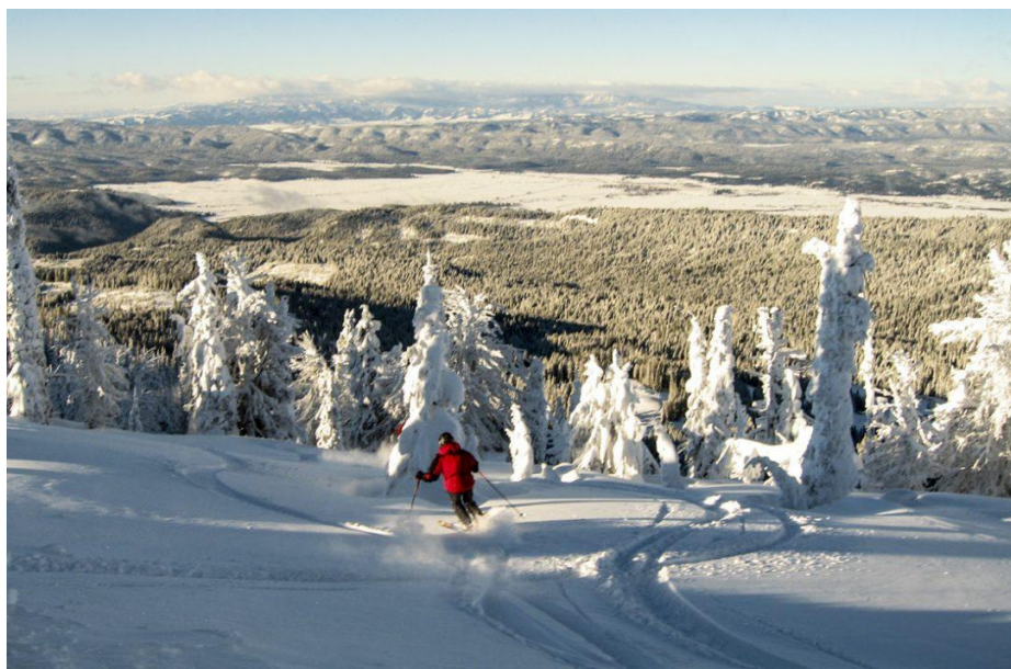
Skiing fresh powder at Brundage Mountain.

Brundage Mountain in McCall, ID, is one of those places that truly “skis bigger” than it is.