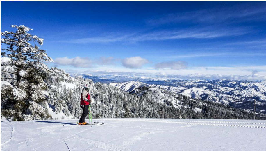
View from the top at Bogus Basin, the ski resort outside Boise, ID

This Non-Profit Ski Area Is Community Owned And Prices Reflect It.