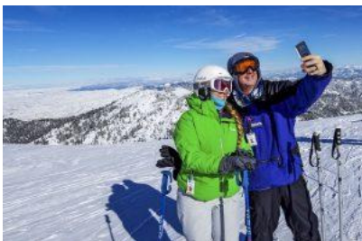
Skiing couple takes a selfie at Bogus Basin outside Boise, ID.